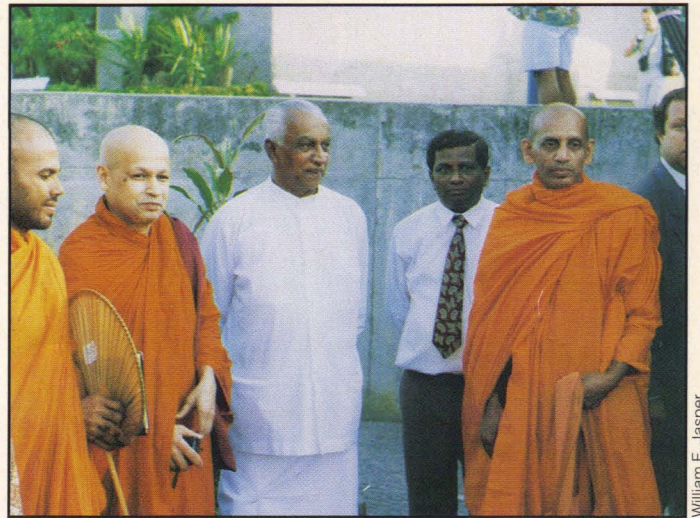
A pagan spirit dominated the summit activities

At the first plenary session, Uri Marinov, Israel's Minister of the Environment, issued a New Ten Commandments on Environment and Development. No