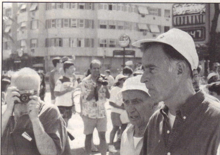
Jerry Brown beamed down for a cameo appearance at the summit

One could not go far in Rio without running into blatant examples of green hypocrisy. Consider, for instance, UNCED transportation. Most of the thousands of delegates, UNCED employees, Non-Governmental Organizations (NGOs), and members of the press attending Eco '92 rode the UN chartered buses from their beach hotels to the Rio Centro convention site some 30