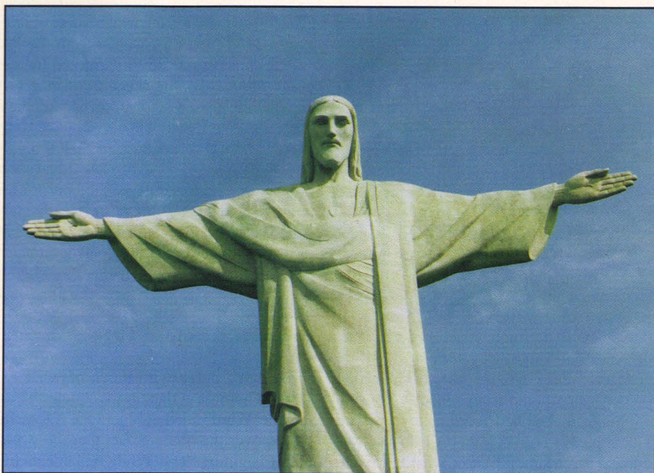
The majestic form of Rio de Janeiro's Christ the Redeemer statue stood silent vigil over the chaotic din of the Earth Summit

From the standpoint of the awful potential that the summit held for saddling the United States with sovereignty-destroying treaty commitments and enormous financial-aid outlays, the results of the global confab can be greeted with some relief; it could have been worse. After all, we didn't sign the legally binding Biodiversity Convention. We didn't agree to the UN plan for doubling our financial aid to developing countries to 0.7 percent of U.S. gross national product by the year 2000. The global warming treaty signed by President Bush was "watered down" from the original version; it sets no firm targets or timetables for reduction of CO 2 and other "greenhouse gas" emissions, reductions that could decimate American