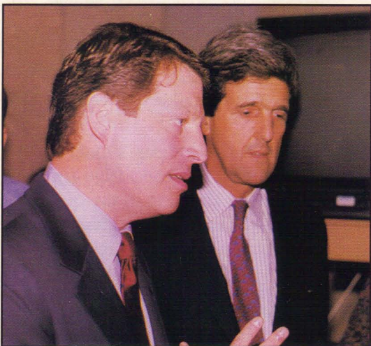
Gore, flanked by Senator John Kerry, dutifully spouted New Age exhortations

But for most of the tens of thousands of Earth Summiters who descended on Rio, Christ the Redeemer held little, if any, attraction. They had rejected Him for the green-theology mishmash of earth worship and New Age mysticism.